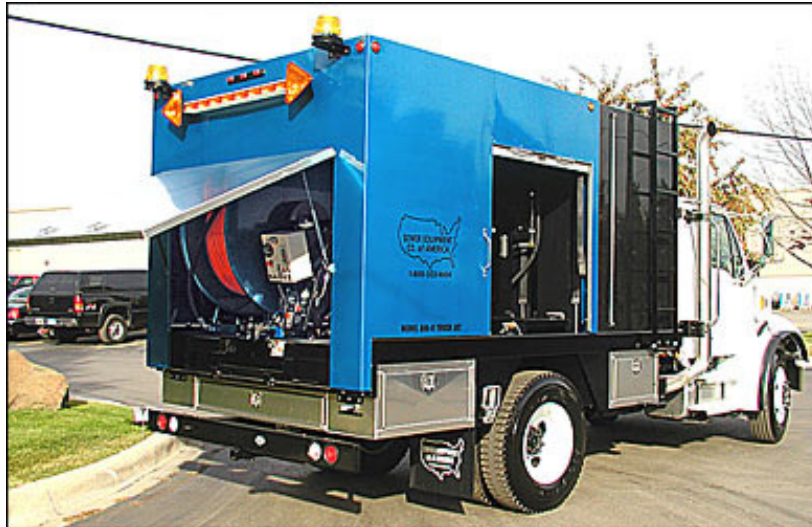
Model 800-H Truck Jet Truck Mounted High Velocity Sewer Cleaning Machine With - Hydrostatic Drive -